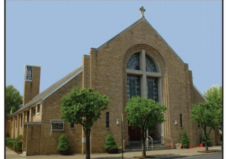
Immaculate Conception Church

As we continue to celebrate the joy of Easter, the Lord's light lives in each one of us. We are all called to reveal the living Christ to the world in the way we serve one another, especially those in need.