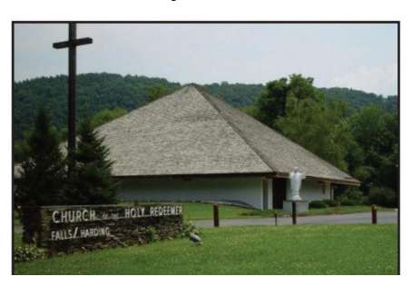
Church of the Holy Redeemer

From the very first day, we recognized that we are all neighbors sharing the same faith. Under the leadership of our staff, Parish Pastoral Councils and Finance Councils, as well as our many other ministries, we made each other feel welcomed and comfortable - no matter which church building you attended. We quickly realized all we had in common, especially our faith and desire to serve those most in need. I am so grateful to be your pastor.